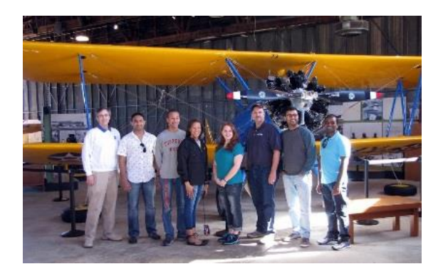
Section members with PT-17 primary training aircraft.

Thirteen Greater Huntsville Section professional members and guests, including one professional member from Auburn and two from Tuskegee, met up with 18 AIAA Tuskegee University Student Branch members for a full day of tours and networking. The group began the day at the Tuskegee Airmen National Historic Site at Moton Field, to tour the museum and the flying field where Tuskegee Airmen trained. Coincidentally, five busloads of Officer Trainees from Maxwell Air Force Base were also touring the museum, allowing an